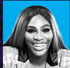
Serena Williams Opening Keynote Speaker Winner of 23 Grand Slams, philanthropist and entrepreneur