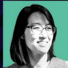
Ellen Pao Keynote Speaker CEO and co-founder of nonprofit Project Include