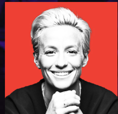
Megan Rapino Closing Keynote Speaker 2-Time World Cup Champion and activist