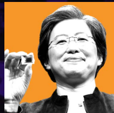
Dr. Lisa Su Keynote Speaker & Technical Leadership Abie Award Winner CEO and President of Advanced Micro Devices (AMD)